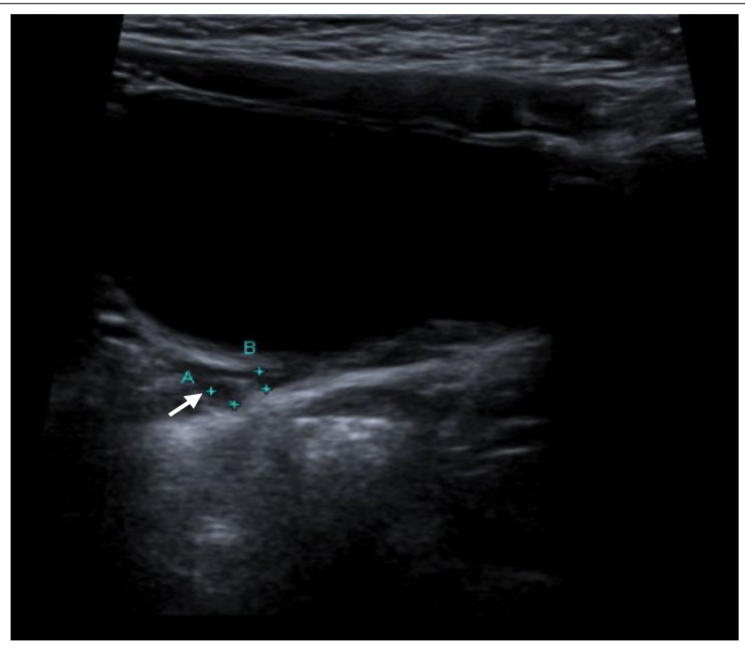
Figure 2: Suprapubic bladder ultrasound, showing the right seminal vesicle with a cystic appearance (white arrow).

vesicle cyst and ipsilateral ejaculatory duct obstruction [1-4]. This condition is quite uncommon, with fewer than 200 cases reported in the medical literature, and its estimated incidence is approximately 0.00035% to 0.0046% [2].