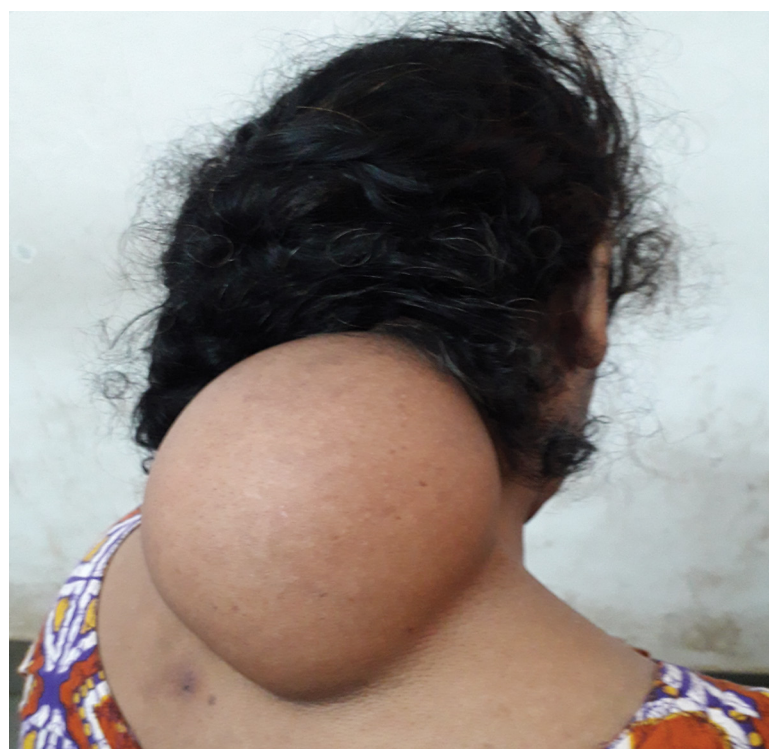
Figure 1: A large, soft, globular swelling in the back of the nape of the neck.

tests were negative. The skin was free and the swelling was freely mobile on the underlying structures. The swelling became more prominent on contraction of the underlying trapezius muscle. Its location and clinical examination suggested the diagnosis of a subcutaneous lipoma. Owing to the physical discomfort it was causing, the lipoma was successfully excised. Histopathological examination (Figure 2) of the specimen confirmed the diagnosis of a lipoma.