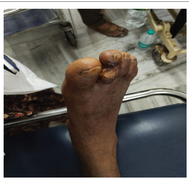
Figure 3: Showing cellulitis of right second toe.

Figure 2: MRI brain large area of acute infarct distributed in left temporooccipito parietal lobes, capsuloganglionic region and corona radiate - MCA territory.