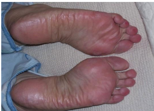
Figure 1: On presentation our patient had erythema, swelling, and perspiration of the soles of her feet. These findings are characteristic of erythromelalgia, which can occur de novo or in association with several medical conditions, including hypertension and polycythemia. The erythromelalgia resolved as her fever subsided and her hematologic parameters returned to normal.

Over the next several weeks, her fever and respiratory symptoms resolved, and her hematologic parameters incrementally returned to normal, pre-illness values (Figure 2). The patient's diuretic therapy was discontinued and she was placed on a combination of a beta blocker (metoprolol), a short acting calcium channel blocker (amlodipine) and an angiotensin converting enzyme receptor inhibitor (Losartan) for treatment of her hypertension. Since then, she has had better control of her blood pressure, and no further episodes of Gaisbock's syndrome.