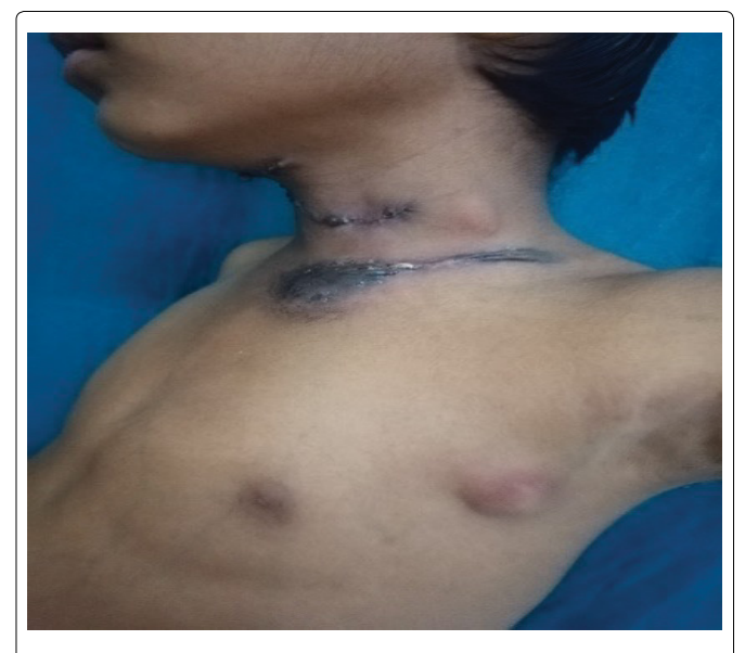
Figure 2: It shows single soft swelling over left axillary region.

Tuberculosis is one of the biggest health crisis in India accounting for 2.2 million cases each year [4]. Cutaneous tuberculosis accounts for only 0.1-0.9% of total out-patients in dermatology in India. Most commonly