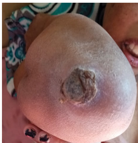
Figure 7: Elbow erosion.

Methotrexate chemotherapy. The patient was treated with broad spectrum antibiotherapy, corticosteroid at the dose of 1 mg/kg, mouth wash, alkaline hyperhydration and rescue with folic acid.