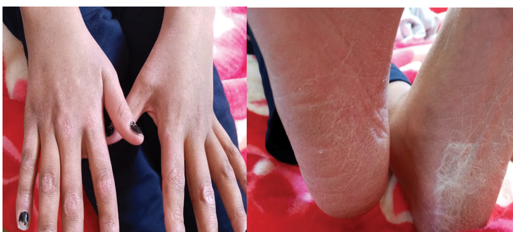
Figure 10: Squamous lesion in the extremities.