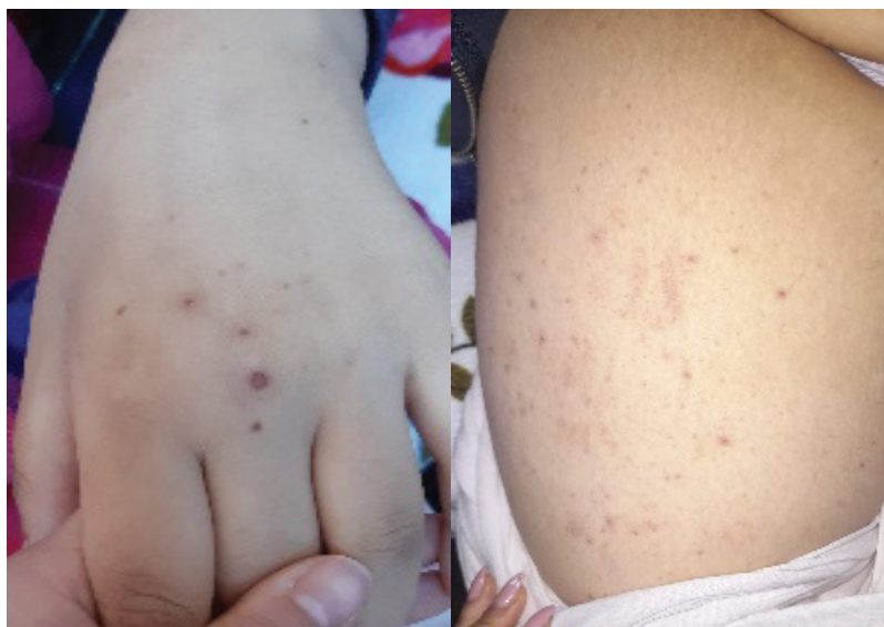
Figure 4: Lesions cockade on the level of the backs of the hands.