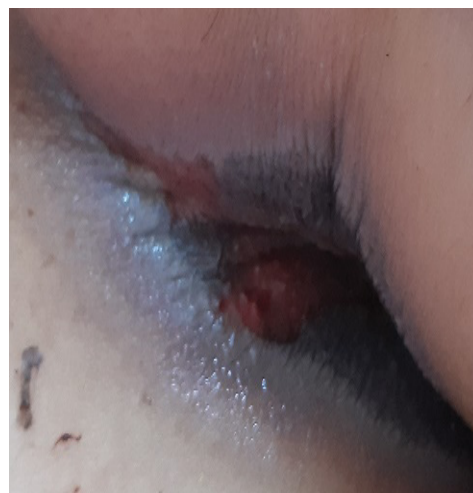
Figure 6: Perianal ulceration.