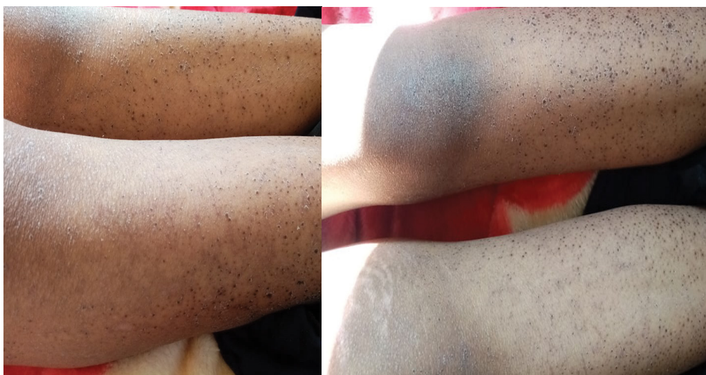
Figure 9: Purplish rash in the limb.