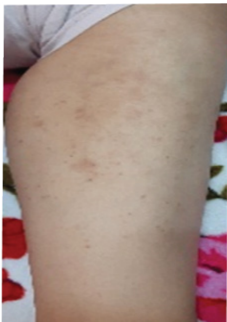
Figure 5: Macular rash.