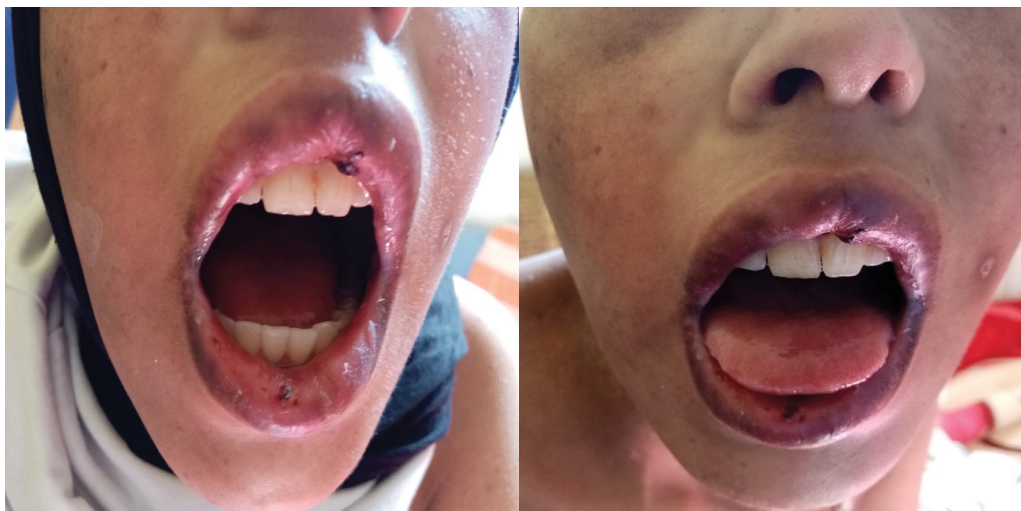
Figure 8: Ulceration in the mouth.