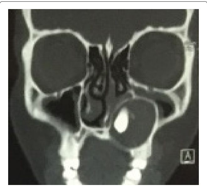
Figure 1: Hyperdensity within unilocular well-defined hypodense image on the left maxilla. View in a coronal section.

In the computed tomography was observed a 4 cm hypodense, unilocular, well-defined and non-invasive image located on the left maxilla. A hyperdense image, compatible with unerupted left canine was noted within the lesion (Figure 1), and displacement of the maxillary sinus.