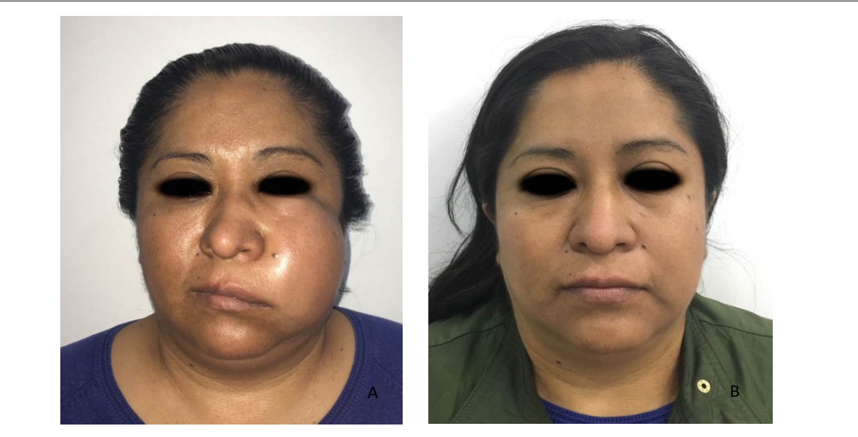
Figure 1: A) Swelling of the buccal space, Loss of nasolabial fold; B) Remission of infection.