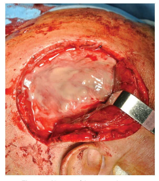
Figure 4: Abscess of the temporal space.

and heart, early diagnosis and treatment should be carried out to prevent danger to the patient's life. The OI has a mortality rate of 10-40% [25].