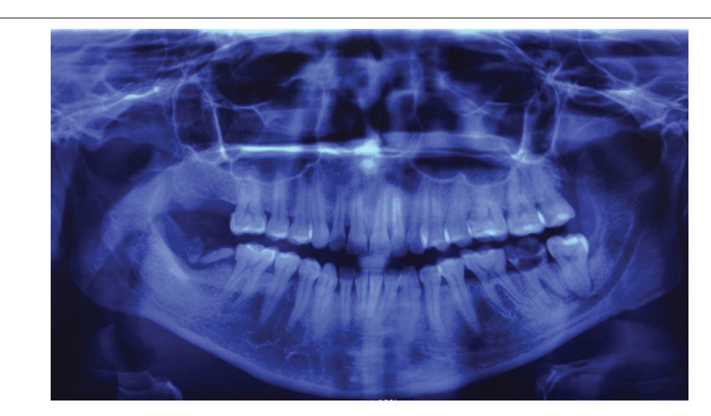
Figure 2: Panoramic X-ray, Periapical osseous destruction of the second left lower molar. Roots remains of the second right lower molar.