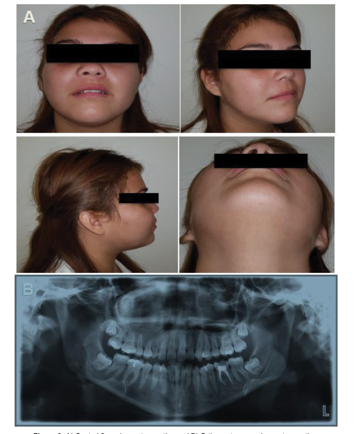
Figure 3: A) Control 2 weeks post operative and B) Orthopantomography post-operative.

It commonly arises in the maxillary bone in a 2:1 ratio with the mandible, with a predilection for the anterior part of the maxilla over the posterior region. The teeth of greatest to least affection are canines, incisors, premolars, molars, being the permanent canine the one that is associated with 51% of cases, they can also be associated with temporary teeth, supernumerary teeth, non-erupted third molars and even odontomas. 80% of cases occur in the 2<sup>nd</sup> and 3<sup>rd</sup> decade of life approximately, with women under 30 years of age being the most affected, the ratio between women and men of 2:1 [1,2,4,7-9]. In a study from South Africa, AOT accounted for 4% of all odontogenic tumors, where women were affected six times more often than men [9].