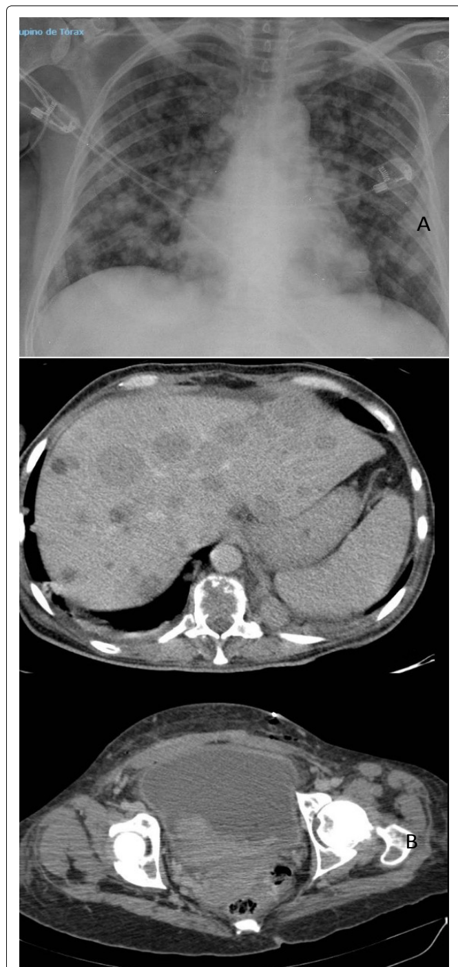
Figure 1: A) Cottony infiltrates at X-Ray; B) TC scan showing bladder lesion and metastatic lesions at liver.

opsies for etiologic diagnosis. At TUR, it was evidenced by brown excrescence bladder lesion appearance. Microscopic after study shows spindle cell tumour proliferation with areas of necrosis tested positive for S-100, Melan-A and HMB-45 (Figure 2).