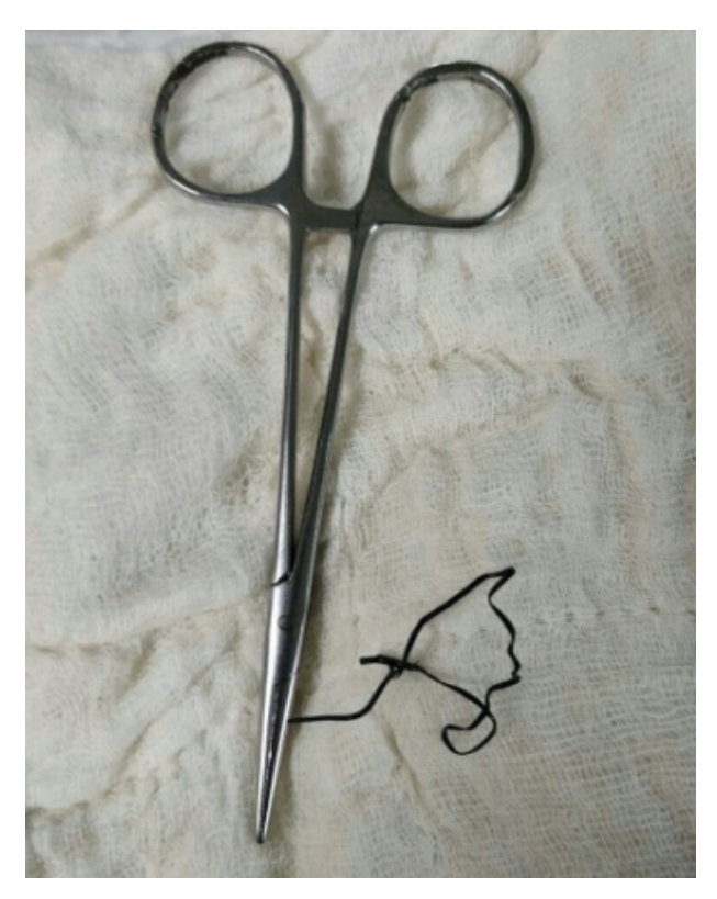
Figure 4: Glide wire jacket removed intact.

The Terumo hydrophilic Glide wire we use consists of super-elastic nitinol alloy core for optimal performance and kink resistance. Tungsten-infused polyurethane jacket provides superior tip and wire radiopacity [4]. When coiled guide wire is pulled forcibly the jacket may get stripped from the nitinol core by the edge of the puncture needle. Attempts to localize the stripped glide wire failed endoscopically since the fragment was lost in the renal parenchyma. Such a fragment may even be difficult to identify in open surgery. Already exhausted by the attempts to identify the lost glide wire and prolonged operative time, procedure was abandoned