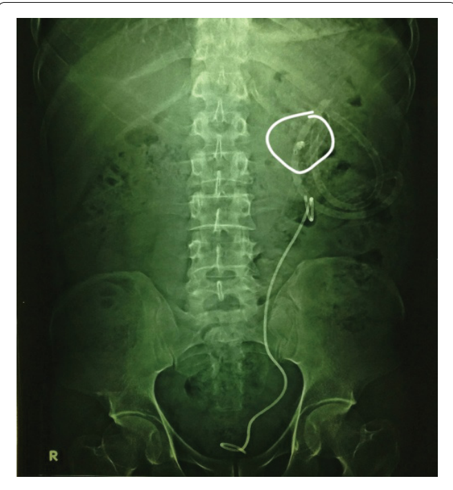
Figure 1: X-ray KUB showing coiled stripped glide wire fragment (white circle).