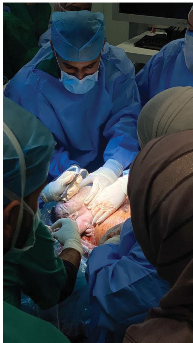
Figure 1: Intubating the baby while the head, neck, and right arm were extracted from the uterus.

After the Lower uterine segment incision only the infant's head and neck were pulled out carefully with the right arm. During the procedure, the rest of the infant's body remained inside the uterus. The anesthesia team applied a sterile pulse oximeter device to the dorsum of the infant's right hand, and the neonatal anesthetist administered atropine 100 mcg and ketamine 4 mg intramuscularly to facilitate intubation before clamping the cord. On the other hand, the neonatal anesthetist,