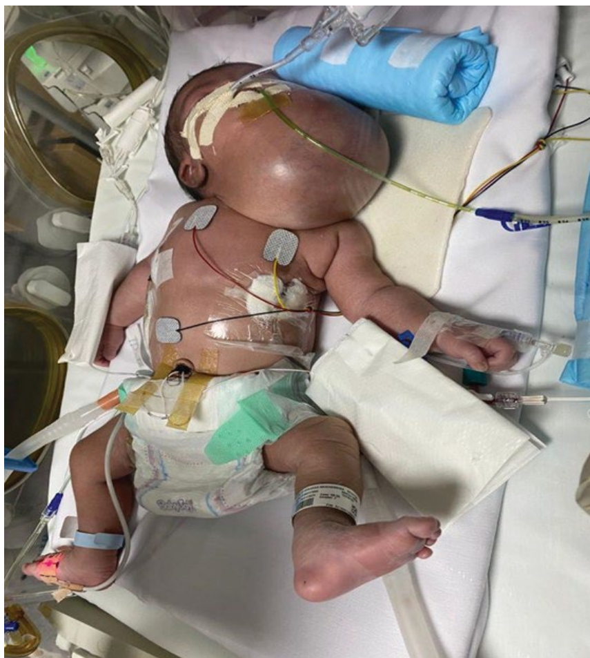
Figure 2: The baby in the NICU incubator after delivery.

and oxytocin and postoperative nausea and vomiting prophylaxis (PONV) were initiated. The placenta was then removed, and the cesarean section was completed without any complications. The estimated total blood loss was approximately 600 ml, and the postpartum period progressed without any notable incidents.