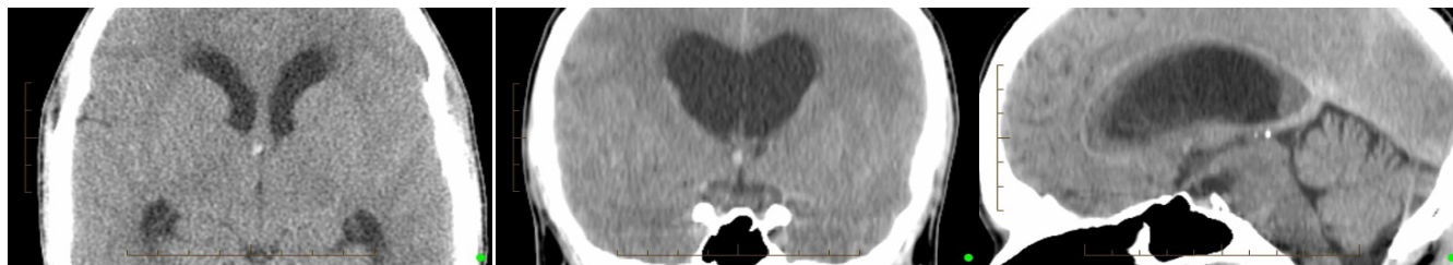
Figure 1: Preoperative CT scan from Left to Right- enlargement transverse image, coronal and sagittal image. These shows moderate lateral ventricular dilatation with transependymal spread of CSF and a 2-3 mm hyperdense lesion in the anterosuperior aspect of the third ventricle.