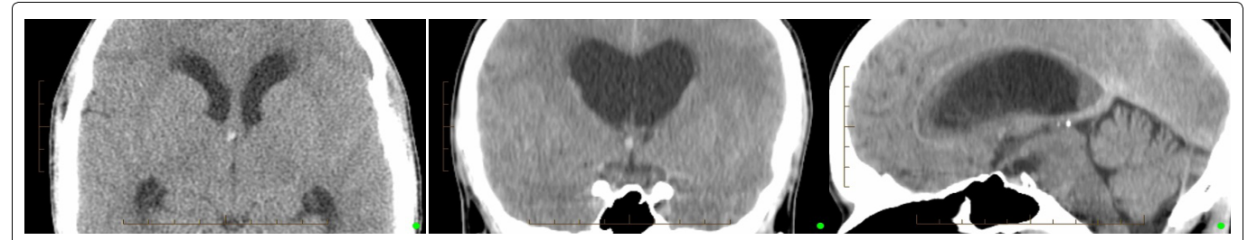
Figure 1: Preoperative CT scan from Left to Right- enlargement transverse image, coronal and sagittal image. These shows moderate lateral ventricular dilatation with transependymal spread of CSF and a 2-3 mm hyperdense lesion in the anterosuperior aspect of the third ventricle.