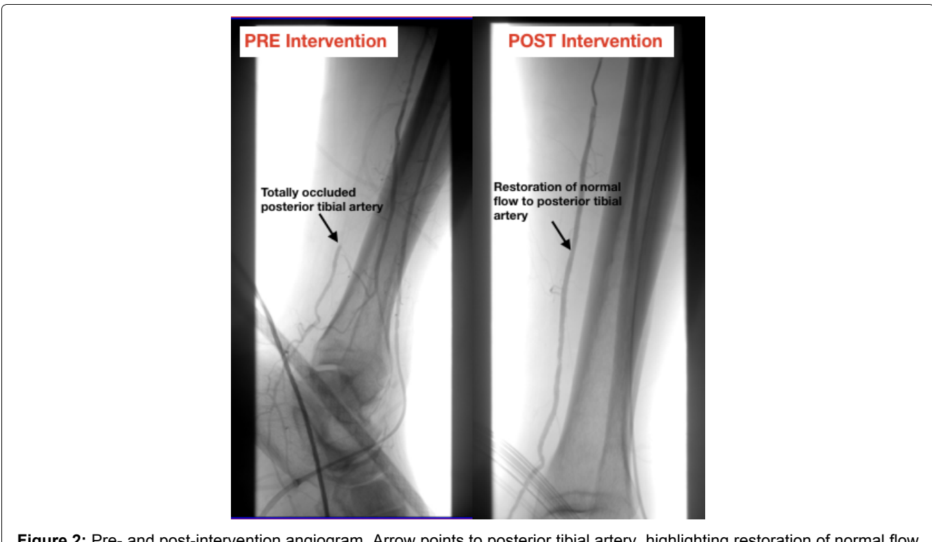
Figure 2: Pre- and post-intervention angiogram. Arrow points to posterior tibial artery, highlighting restoration of normal flow after intervention.