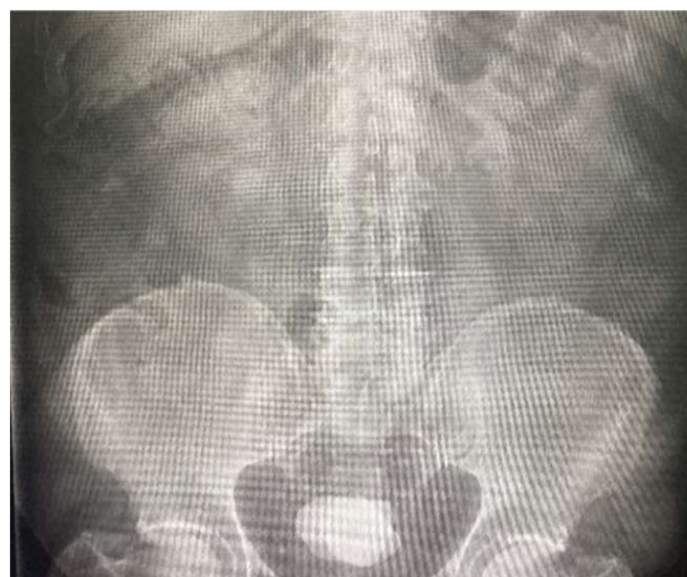
Figure 1: We took the initiative to perform an abdominal ultrasound on the patient where we observed two hyperechogenic images of 6 and 4.5 cm in length, respectively, with posterior acoustic shadow compatible with bladder lithiasis.

One of the first complementary tests requested after the examination of our patient is an abdominal X-ray where two superimposed radiopaque images difficult to determine were observed, so, while waiting for the rest of the results, we took the initiative to perform an abdominal ultrasound on the patient where we observed two hyperechogenic images of 6 and 4.5 cm in length, respectively, with posterior acoustic shadow compatible with bladder lithiasis (Figure 1).