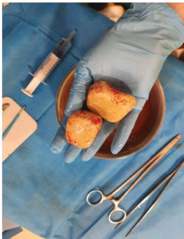
Figure 3: In addition to being useful, it is a harmless and low-cost technique with a theoretically easy and fast learning curve that will allow us to speed up the diagnostic and therapeutic process of the possible pathologies for which we may be consulted.

After these findings, it was decided to consult with the Urology Department, who confirmed the diagnosis and, in a short time, the patient underwent surgery with extraction of both bladder stones, resolving the condition for which he had consulted our Emergency Department (Figure 2).