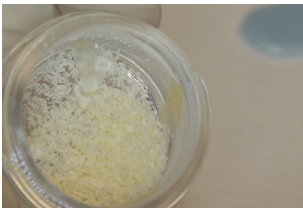
Figure 4: The allograft bone mixed with the amnio strips.