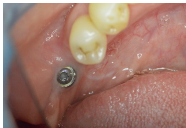
Figure 7: Two weeks healing following the procedure.

was asymptomatic. The radiographic exam (Figure 1) revealed considerable bone loss with no other findings. The implant crown was removed and a cover screw placed. The Surgical treatment included a circumferential incision around the implant (Figure 2) followed by excavating the granulation tissue into the bony defect, scaling the implant surface using ultrasonic scalers and then using Prefgel to decontaminate the implant surface (Figure 3). A bone mix of mineralized cortico-cancellous allograft with Am-