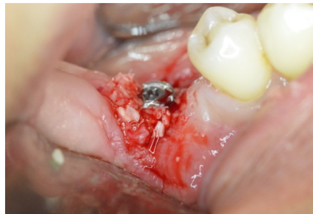
Figure 5: The allograft mix placed around the implant.