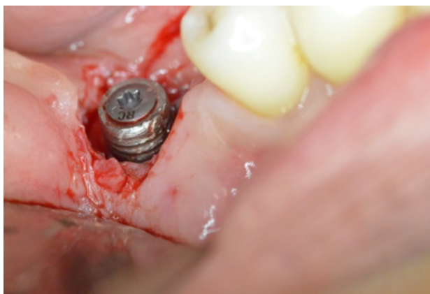
Figure 2: Circumferential incision around the implant with removal of the granulation tissue.