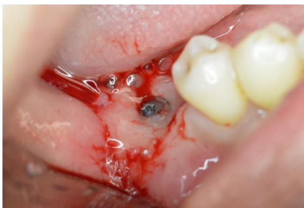
Figure 3: Prefgel placed around the implant following ultrasonic debridement.