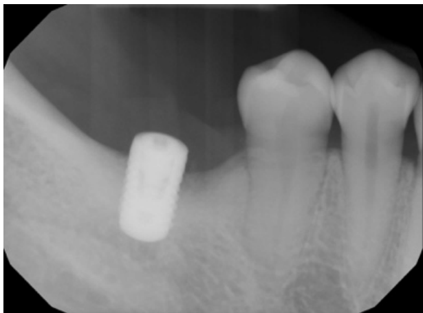
Figure 8: Periapical film of the treated implant eight weeks following the treatment.