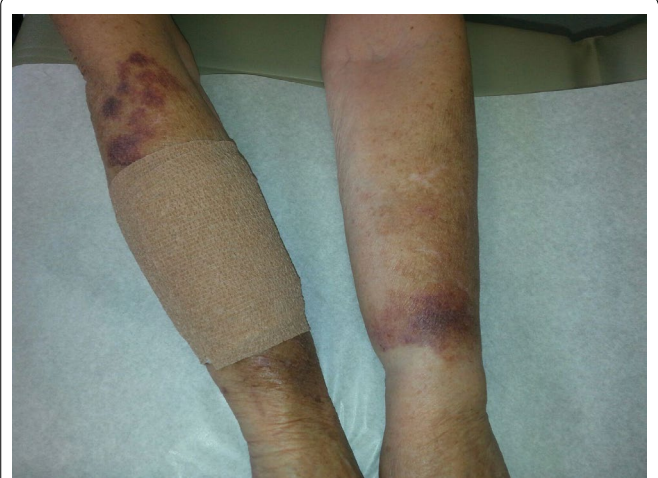
Figure 1: Purpuric patches on the forearm.

The patient denied trauma to the areas of discoloration and denied any other symptoms, except mild irritation, sensitivity, and itching of the areas affected. At the time of the biopsy, the patient