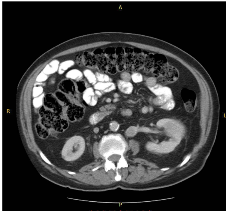
Figure 1: IVC located in the left of the midline as well as total aplasia of superior vena cava.