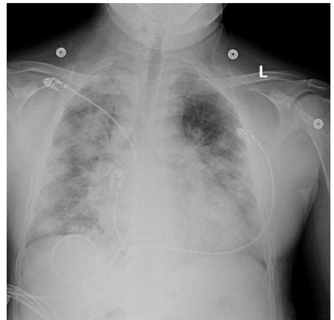
Figure 1: Chest X-Ray taken upon admission.

Legionella pneumophila is an aerobic, pleomorphic, flagellated, non-spore-forming, Gram-negative bacilli. Legionella is transmitted through aerosolized particles and can be found in surface water, drinking water, and tap water used on surgical wounds [1]. Legionella has been recognized as an important cause of community and hospital-acquired pneumonia. Legionella has