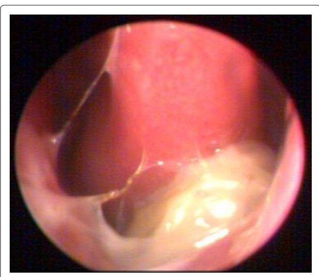
Figure 1: Preoperative endoscopic examination revealed inferior turbinate hypertrophy firm with palpation.

FD can be classified into 4 types; Monostotic type with a single bone involvement (70%), polyostotic type with multiple bones