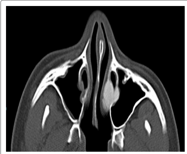
Figure 2B: Axial CT scan of the patient.

involvement (30%), McCune Albright syndrome (polyostotic FD, Café au lait pigmentations and endocrine pathologies) and Mazabraud syndrome (FD and soft tissue myxomas). Approximately 50% of patients with polyostotic disease and 10% -27% with monostotic disease have craniofacial involvement [5]. Craniofacial FD typically presents at around 10 years of age and then progresses throughout adolescence [3].