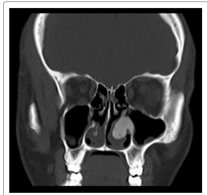
Figure 2A: Coronal CT scan of the patient. Left inferior turbinate and a small part of the medial wall of the left maxillary sinus have a ground glass appearance with normal mucosa.