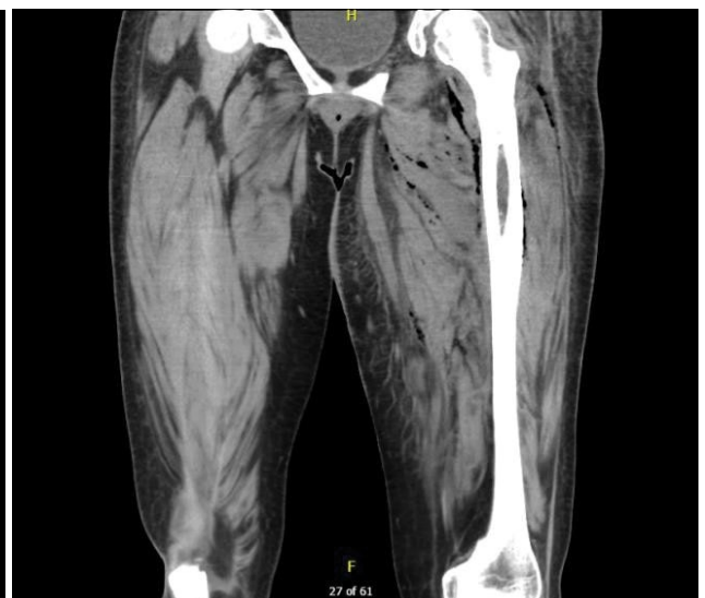
Figure 1: (A) Axial Computed tomography (CT) image demonstrated a thickened mural wall of the descending colon and abscess formation around this area; (B,C) Axial and coronal CT image showed a diffuse air foci at left thigh in the fascial plane which extend to left psoas and iliacus muscle.

tomography (CT) of the abdomen, pelvis and upper lower limb showed focal mural thickening and irregularity of the descending colon with surrounding multiloculated intra and retro peritoneal collection, with downward extension of fluid and air to the left iliac fossa. Also the CT showed diffuse air foci at left thigh in the fascial plane which extend to left psoas and iliacus muscle. Those findings are suggestive of a ruptured tumor or inflammatory process with extension of fluid and air into the left lower quadrant and left thigh consistent with necrotizing fasciitis (Figure 1).