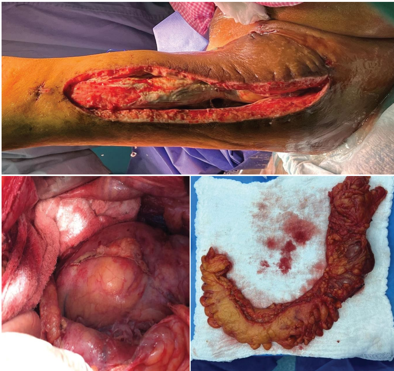
Figure 2: (A) Additional extensive open wound for drainage from the initial drainage site of the left thigh; (B) Intraabdominal image demonstrating the left colon; (C) Surgical specimen of the left hemicolectomy.

postoperative course requiring multiple subsequent debridements of her left thigh wound, finally a left lower limb disarticulation from hip joint and closure done via posterior flap was made. Her respiratory status declined briefly requiring intubation but ultimately improved. Her renal function recovered with supportive care. Oncological evaluation found stage III colorectal adenocarcinoma. After decannulation and gradual improvement, she was deemed stable for transfer to a higher center for adjuvant management.