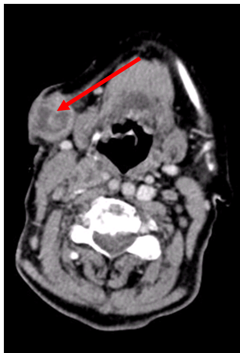
Figure 2: Neck CT scan: Multiple necrotic cervical lymph nodes, the biggest subcutaneous, 27 mm in diameter (arrow).

A full-body Computer Tomography (CT) revealed mul-