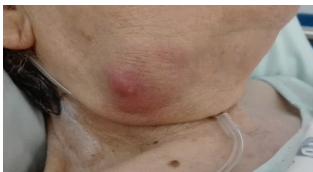
Figure 1: Photo of the right submandibular mass.

Her past medical history included essential hyper-