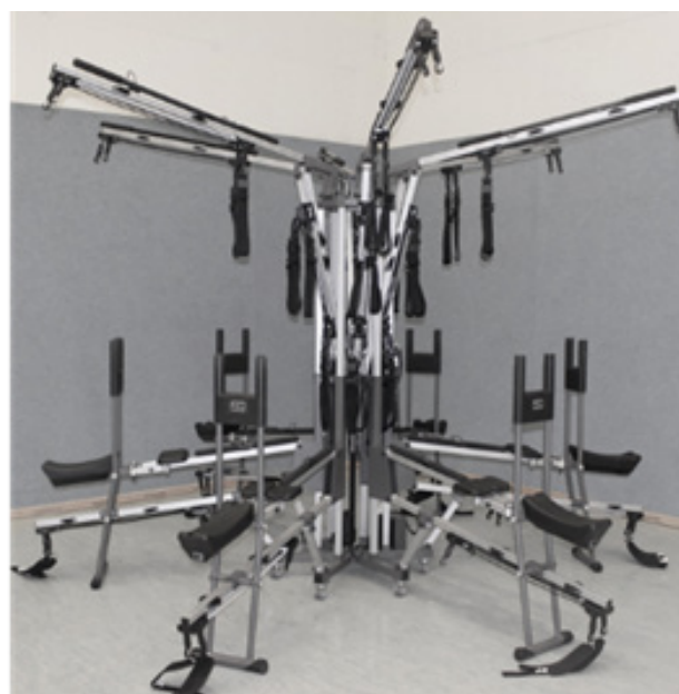
Figure 2: Intervention Devices ((a) Sports and Dance Walker/ (b) Body-Spider).