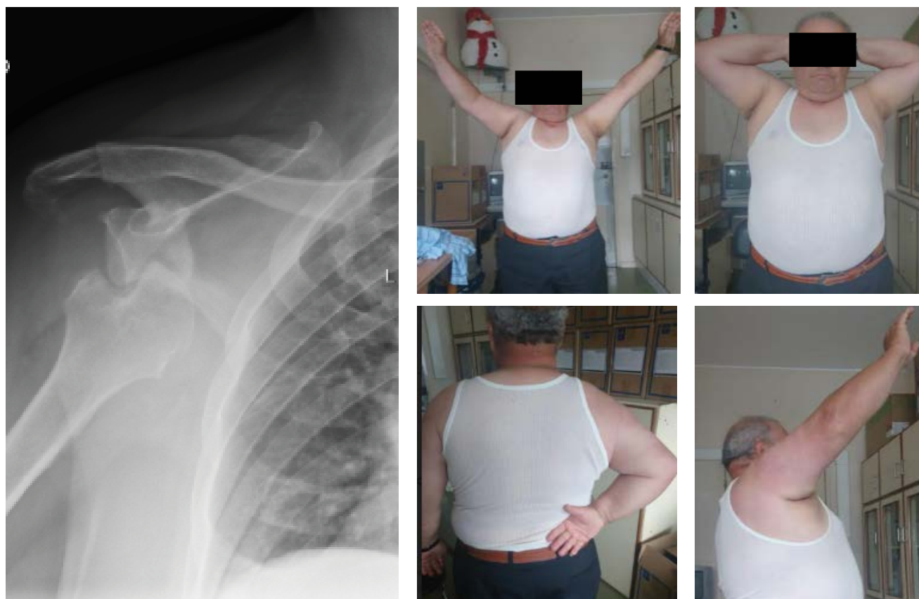
Figure 2: Pre-op X-ray AP views; Latest follow-up mobilities.

Van Togel, et al. in a more recent retrospective study of 6 patients with anterior glenohumeral dislocation that were treated with a reversed shoulder arthroplasty, evaluated the postoperative Constant-Murley (CM) score. Average age was 73 years, average time of dislocation was 18 weeks and average time of follow-up was 39 months. CM improved from 33 pre-operatively to 76 postop (between 55 and 89). No postoperative complications were observed. The authors concluded that Reversed shoulder arthroplasty gives good results in cases of chronic glenohumeral dislocation and realized that Predictable results can be obtained similar to the literature of the reverse prosthesis in trauma of the proximal humerus [20].