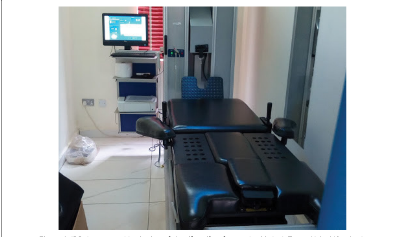
Figure 1: IDD therapy machine by Accu-Spina (Steadfast Corporation Limited, Essex, United Kingdom).

Following the limitations of hands-on treatment techniques and the pitfalls of traditional traction, Intervertebral Differential Dynamics (IDD) was developed in the late 1990's for isolated 5 to 7 millimetres of vertebral distraction surrounding an injured cervical or lumbar disc