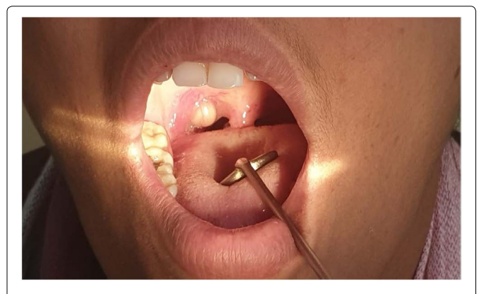
Figure 3a: Localised, yellowish, smooth swelling over the medial aspect of right tonsil with congestion of surrounding tonsillar tissue.