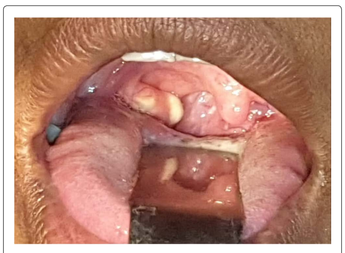
Figure 1a: Showing a pale yellow swelling seen in the substance of right tonsil.

A 35-year-old woman presented to our ENT Out Patient Department with complaints of recurrent episodes of swelling and pain in the right tonsillar region and odynophagia for a duration of 1 month. On examination: the patient was afebrile (96.7 °F) with pulse rate of 92 beats per minute and blood pressure of 116/76 mmHg. A complete ENT examination revealed a pale yellow swelling seen in the substance of right tonsil 4*5 cm, medially extending up to the midline, it had a soft, cystic consistency and was tender on palpation as in Figure 1a and Figure 1b. Rest of the oropharyngeal examination was normal. Neck examination showed palpable, jugulodigastric lymph node 2*1 cm, mobile tender, soft.