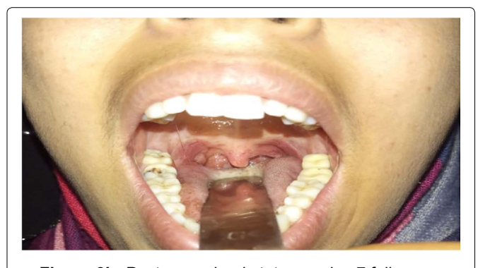
Figure 3b: Post-procedural status on day 7 follow up.

tivities showed the efficacy of ceftazidime, amoxicillin & clavulinic acid. Tab Cefpodoxime 200 mg + Clavulinic acid 125 mg bid with analgesics were prescribed was given. Patient was free of symptoms in 7 days with no complications.