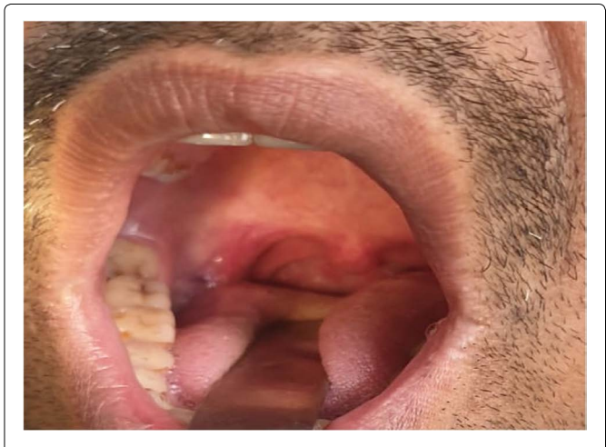
Figure 2b: Patient came to us for follow up on day 7.

A 34-years-old male patient came with fever of 3 days duration and right sided throat pain and odynophagia since 1 week. His vitals were within normal limits. On examination, right sided tonsillar swelling measuring 1*1 cm with hyperemia of unilateral oropharyngeal structures was seen as depicted in Figure 2a and Figure 2b. No palpable neck nodes were found. Investigations showed WBC count of 14,300 cells/mm³ with peripheral neutrophilia. Patient was subjected to needle aspiration and pus retrieved was sent for culture sensitivity which reported the growth of staphylococcus aureus. Sensi-