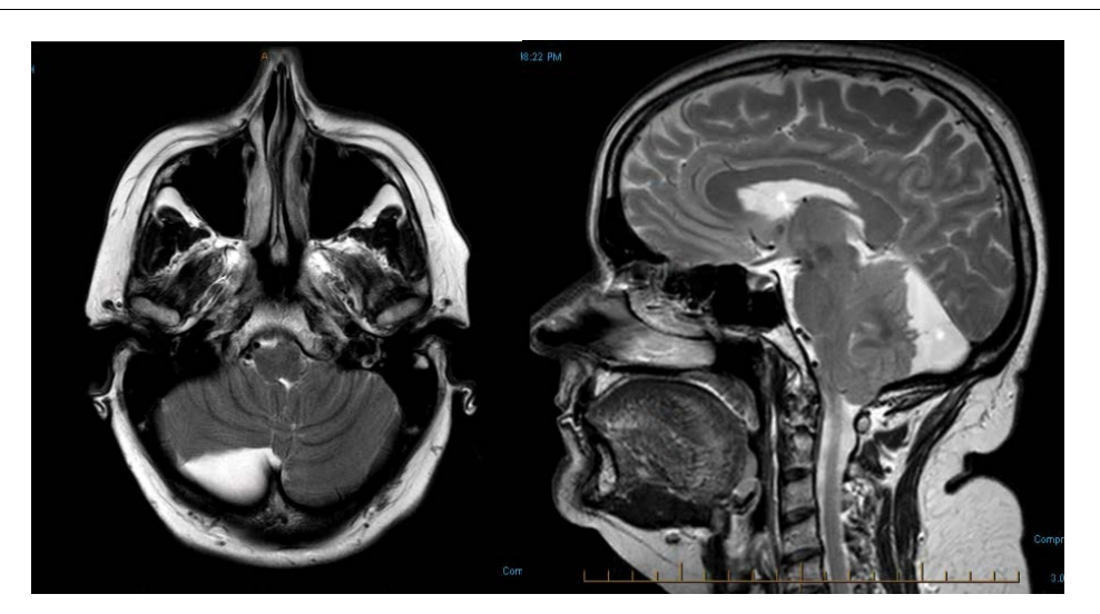
Figure 1: MRI showing initial diagnosis of retrocerebellar arachnoid cyst in 2008.

Figure 1a: T2 weighted axial MR image showing a right retrocerebellar arachnoid cyst, measuring 19 mm anteroposterior, 39 mm transversely and 40 mm craniocaudal at timing of initial diagnosis in 2008.