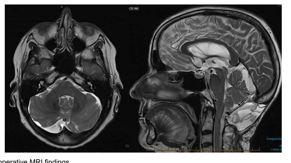
Figure 3: Postoperative MRI findings. Figure 3a: T2 weighted axial MR image.

Figure 3b: T2 weighted sagittal MR image of the postoperative status. The mass effect of the retrocerebellar cyst has been ameliorated, without any tonsillar descent present. There is a reduction of the triventricular hydrocephalus. Cysto-subarachnoid shunt present from residual arachnoid cyst to level of C2.