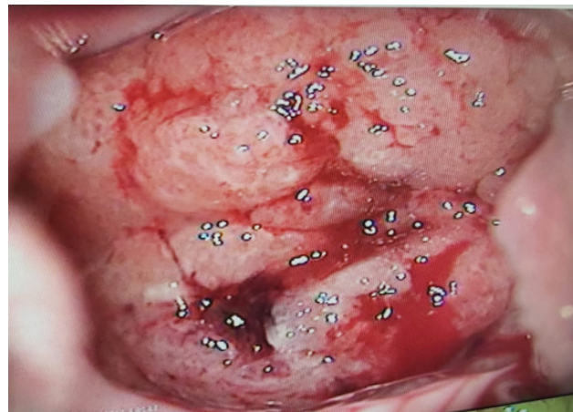
Figure 1: Initial colposcopy appearance of the cervix.

On examination, the cervix was enlarged and friable, transformed in exophytic lesions with papillary aspects (Figure 1).