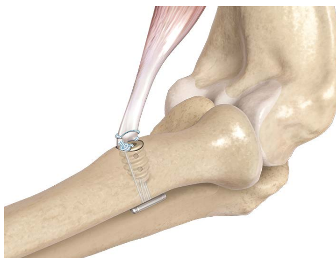
Figure 3: The sutures are tied off, the wound is irrigated thoroughly and closed

All but one patient described their surgery as successful with 16/22 rating their overall experience as excellent compared with 5 good and 1 fair. The average return to work was 100 days (range 0-280 days) with the average return to driving 49 days (range 0-112 days).