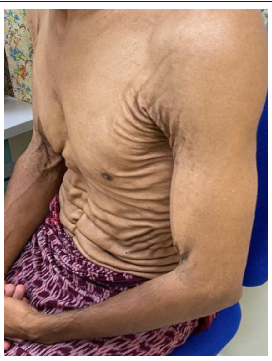
Figure 2: Patient was diagnosed with multiple coagulation factor deficiency.

If he bleeds, needs factor replacement with a PPC (4-Factor), not Vitamin-K. No need for prophylactic treatment as he is not bleeding phenotype.