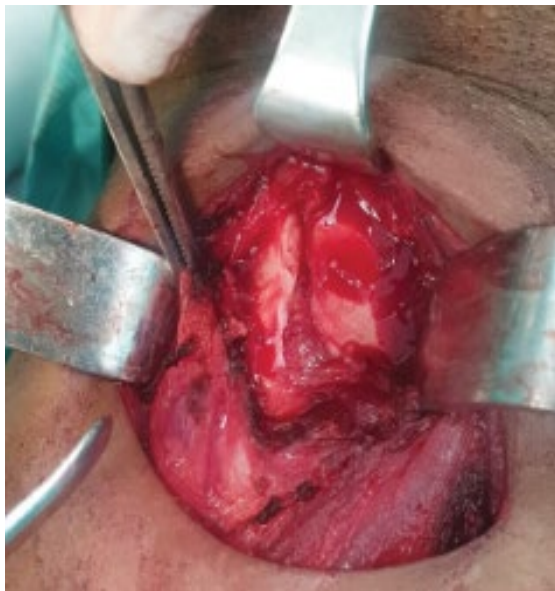
Figure 2: Displaced fracture of cartilage thyroid of the larynx.

The tracheotomy canula was removed on the fifth day after surgery and the patient had been under inhaled and systemic corticotherapy for 1 month.