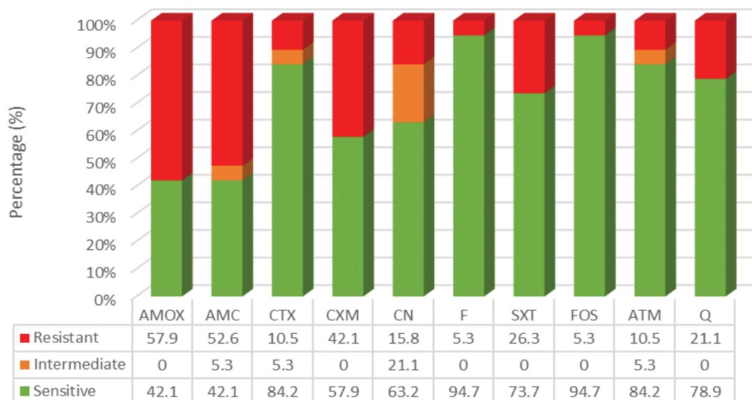
Figure 2: Antimicrobial susceptibility test - kirby-bauer method

AMOX: Amoxicillin, AMC: Amoxicillin Clavulanate, CTX: Cefotaxime, CXM: Cefuroxime, CN: Gentamicin, F: Nitrofurantoin, SXT: Co-trimoxazole, FOS: Fosfomicin, ATM: Aztreonam, Q: Fluoroquinolones