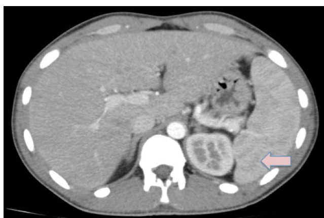
Figure 3: Splenic abscesses.

complication of oropharyngeal infections that usually affects healthy young people [3,4].