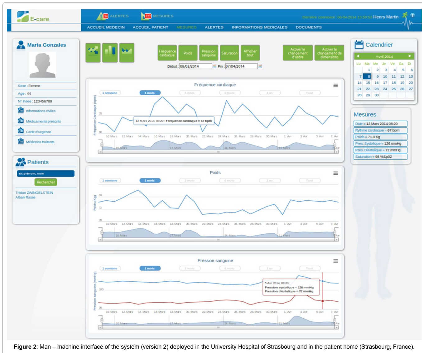
Figure 2: Man – machine interface of the system (version 2) deployed in the University Hospital of Strasbourg and in the patient home (Strasbourg, France).

consecutive adult patients of the 20-bed unit were considered to be including in the study.