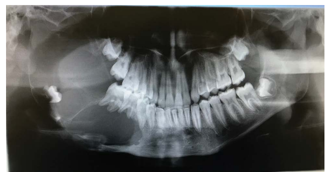
Figure 1: Pre-operative OPG showing the extent of the ameloblastoma involving the entire right hemi-mandible, and including the mandibular condyle and coronoid process.

A 17-year-old male patient presented with right-sided facial asymmetry, and a large bony mass that was painless could be palpated in the lower jaw. The teeth of the involved hemi-mandible were mobile, and there was paraesthesia of the distribution of the lower right inferior alveolar nerve. The patient presented with no systemic compromise, and was otherwise well. A be-