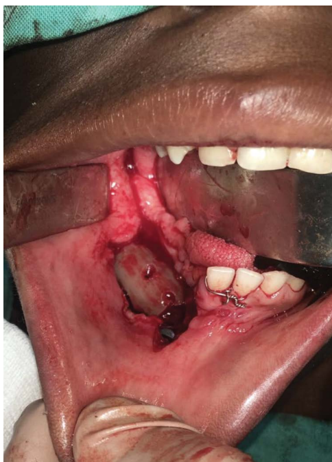
Figure 2: Photograph shows the intra-oral access, and the demineralised humerus conduit containing the PCCB; attached to the reconstruction plate.

nign neoplasm (Ameloblastoma) was suspected and confirmed via incisional biopsy of the right hemi-mandible (Figure 1). A right-sided hemi-mandibulectomy with disarticulation, was subsequently performed via an intra-oral and pre-auricular approach. A preformed reconstruction plate with add-on condyle (DePuy Syn-