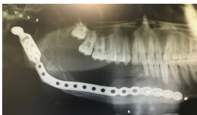
Figure 4: Post-operative (12 months) OPG depicting a now mature ossicle ready to receive dental implants and rehabilitation of the dentition.

thes CMF, West Chester, PA) was used together with an alloplastic Temporomandibular joint (TMJ) fossa (Zimmer Biomet CMF, Jacksonville, FL) (Figure 2). An allogenic demineralised humerus (Bone SA, Bramley, Johannesburg, South Africa) was used as a conduit for a compacted autogenous PCCB graft, harvested from the anterior iliac crest. This bone conduit was then secured to the reconstruction plate (Figure 3) and the intra-oral access closed in two layers. Maxillomandibular fixation (MMF) was applied (released after 4 weeks), and a nasogastric feeding tube (NGT) inserted. The Patient was fed for seven days via NGT and was kept on antibiotic prophylaxis and analgesia for that duration, and then discharged from hospital. Follow-up occurred at regular intervals for 18 months after the surgery (Figure 4).