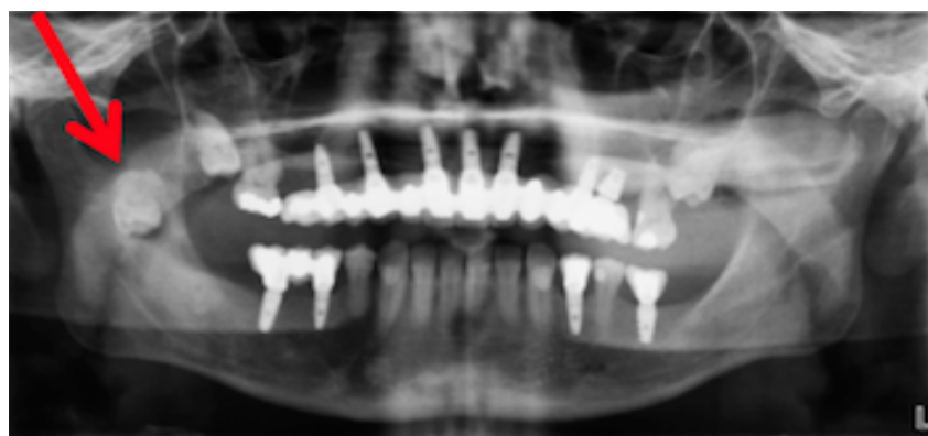
Figure 2: DPT, Ectopic LR8 (denoted by arrow).

The case is uncommon and typically an ectopic wisdom tooth does not often present with severe symptoms and spreading infection. Further review of patient's previous radiographs taken by the patient's implant dentist may reveal pathological migration however this has not been explored. In any case, ectopic migration of the third molar to such an extent is a rare occurrence [6]. A literature search revealed 28 reported cases in the literature where third molars present high up in the ramus or condylar region [7-31]. Other regions of the mandible where ectopic wisdom teeth may present include the coronoid process, sigmoid notch and lower border of the mandible [32]. The incidence of spreading infection with these teeth is uncommon, however there are some cases in the literature. Currently the etiology of