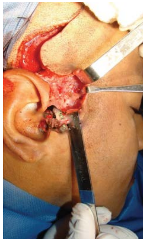
Figure 1: Bicoronal approach with preauricular extension.

The infraorbital nerve is marked with 7-0 nylon and divided. In this manner the upper and lower eyelids, including the orbicularis oculi muscle, are elevated with the flap; however, all lacrimal systems remain in place (Figure 1).