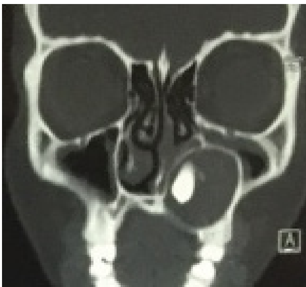
Figure 1: Hyperdensity within unilocular well-defined hypodense image on the left maxilla. View in a coronal section.

In the computed tomography was observed a 4 cm hypodense, unilocular, well-defined and non-invasive image located on the left maxilla. A hyperdense image, compatible with unerupted left canine was noted within the lesion (Figure 1), and displacement of the maxillary sinus.