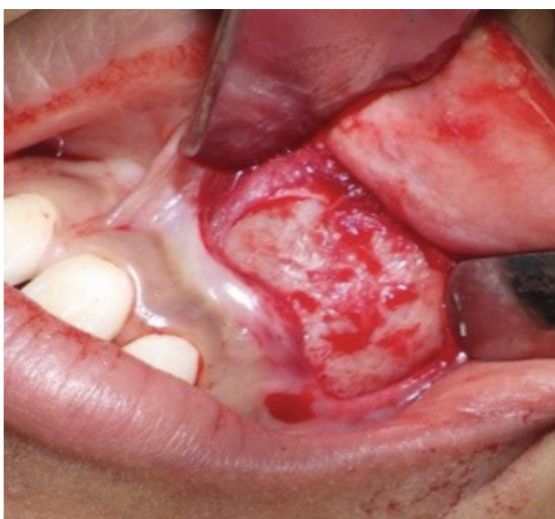
Figure 2: Tumor exposure through vestibular incision.

The treatment, initially, consisted of an incisional biopsy which histopathologic study reported the definitive diagnosis of Adenomatoid Odontogenic Tumor. Posteriorly, under general anesthesia, enucleation and curettage was performed as definitive treatment (Figure 2 and Figure 3).