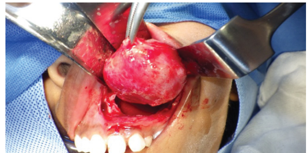
Figure 3: Enucleationy curettage.

The intraosseous variants (follicular and extrafollicular) correspond to 96% of the cases [12]. The follicular variant is associated to the gubernaculum canal, which