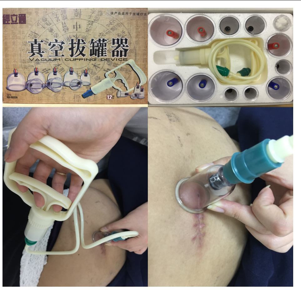
Figure 1: Chinese traditional cupping to suck the fat liquefaction at stimulator implant site after SNM Stage II surgery.