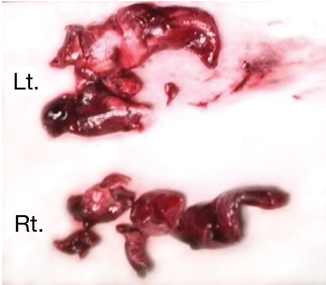
Figure 3: Several fragments of massive embolus which were removed from the left and the right pulmonary arteries.

clot lysis with consequent improvement in pulmonary blood flow, normalization of hemodynamic status, uterine perfusion, and lower risk of bleeding. However, there is no convincing evidence that catheter-directed thrombolytic therapy is superior to treatment with systemic thrombolytics or standard heparin [5]. The consequence of radiation exposure during pregnancy is also unknown.