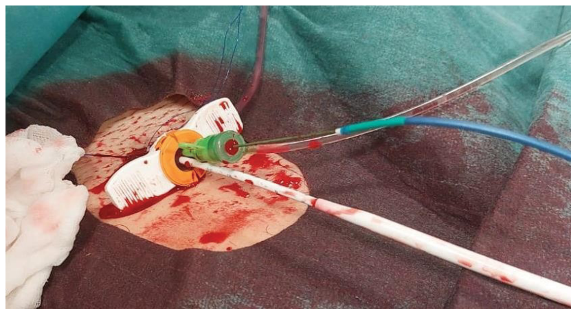
Figure 1: Single-access technique. The Impella 14 F sheath was advanced into the right common femoral artery. Two catheters were introduced into the 14F sheath: a) The Impella CP catheter (white catheter) and b) a 6F sheath (green) through which perform coronary angiography and percutaneous coronary intervention.

The Impella 14F sheath was advanced into the right common femoral artery under fluoroscopic guidance, and the Impella CP device was placed in the left ventricle according to the recommendations. Subsequently, a micropuncture access needle was used to pierce the hemostasis valve in the superior portion of the Impella sheath (with care to avoid piercing the Impella catheter) and a 6F sheath was advanced through a 0.035" guidewire, according to the ShiP technique [5], in order to perform coronary angiography and eventual PCI (Figure 1). A tight (> 80%) distal left main stenosis involving the ostium of left anterior descending in a left dominance system was documented. We therefore performed an Impella-assisted PCI. Using a 6F extra back-up 4 Launcher guide catheter (Medtronic, Minneapolis, MN), a provisional stenting of left main and proximal left anterior descending was performed with final kissing balloon to optimize stent apposition. The final angiographic result was good (residual stenosis < 10% and TIMI 3 antegrade flow). The procedure was carried out without complications. Hemodynamic conditions were stable during the entire procedure and vasopressors were not required. MCS was maintained