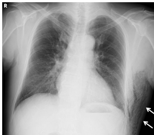
Figure 1: The chest X-ray (anteroposterior view) showed subcutaneous gas formation in the left lateral thoracic.

findings were unremarkable. Initial laboratory findings showed that white blood cell count was 13,000/ \mu L and 60% of neutrophils were band form. Creatine phosphokinase was 2,569 U/L. The radiographs of the trunk showed extensive gas in the soft tissues of the left thoracic dorsal region extending to the pelvis (Figure 1). There were similar findings in the computed tomography of the chest and abdomen without contrast material (Figure 2). One hour after admission, a diagnosis of necrotizing soft tissue infection was made. Broad-spectrum antimicrobial agents including vancomycin 0.5 g every 12 hours (Day 1 - Day 3), meropenem 1 g every 12 hours, clindamycin 600 mg every 8 hours were urgently administered together with crystalloid rehydration and vasopressors. However his skin discoloration region gradually expanded by the hour. The patient deteriorated rapidly and 7 hours after admission he demonstrated septic shock. The patient was taken immediately to the operating room for urgent surgical debridement. The range of myonecrosis with gas formation was too extensive for