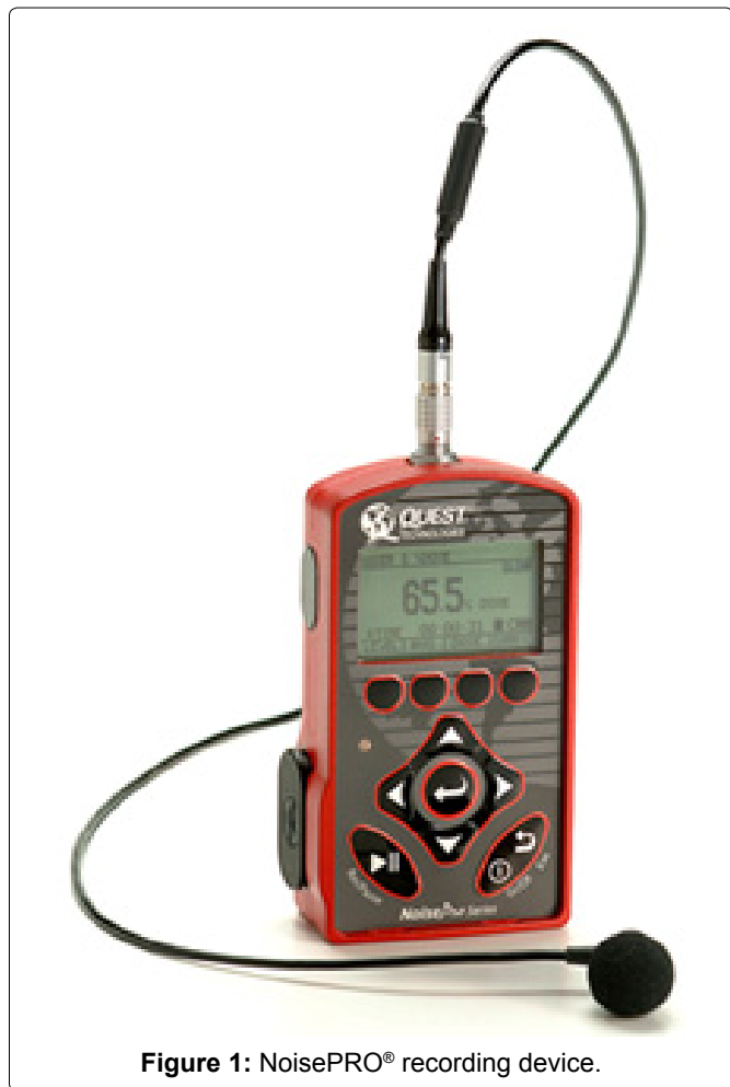
Figure 1: NoisePRO® recording device.

Data was collected from the patient's chart regarding the use of sedation: Boluses and or increases in sedation infusions were noted, the time and dose of this sedation were recorded. These sedation requirements