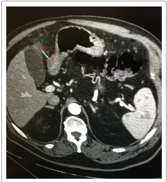
Figure 1: CT scan: A linear foreign body, measuring 17 mm in length, is lying between the gastric wall and the liver; a thickening of stomach in the pyloric area is present, without signs of perforation.

A further anamnesis was made, and the patient revealed a fish dinner one week before.