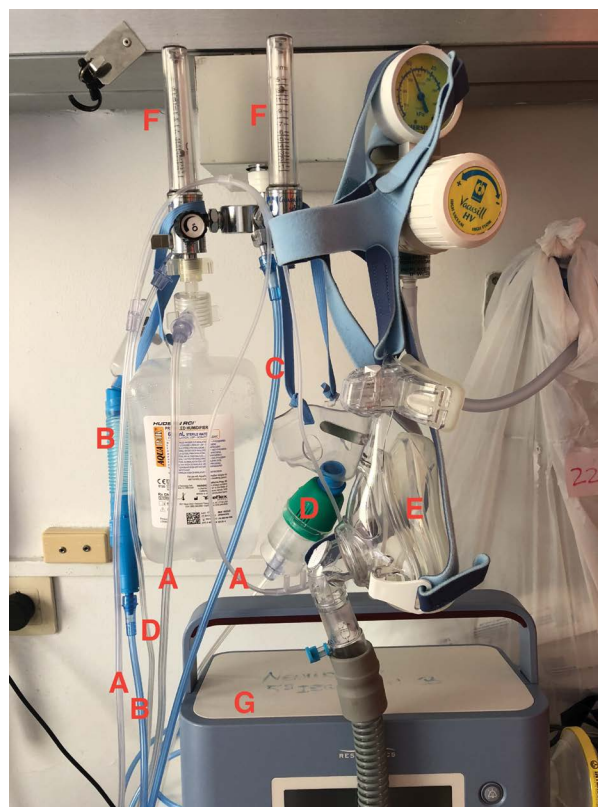
Figure 4: This patient has several O 2 supply possibilities to be treated: a) Cannula nasal; b) Venturi mask; c) High flow nasal cannula; d) Nebulizer; and e) Noninvasive ventilation mask, f) Two double flowmeter, g) A ventilator, too many tubes, several possibilities to make a mistake.

Airvo 2 has an internal menu where we can select temperature, flow and FiO 2 alarms. For example, if we do not want a certain FiO 2 to be exceeded, we can select