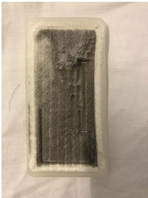
Figure 1: A dirty filter can compromise the efficiency of the turbine.

We should not trust when we use HFNC, but above all we should be very cautious in critical patients. In these patients, a cut in the power supply can cause a serious health problem. The absence of a battery prevents the device from being used in in-hospital patient's movements (radiology, for example), unless it is connected to an external battery. Moreover, patients cannot go to the toilet unless they interrupt therapy, which is not always possible. It is something that we must consider if the patient cannot stop the treatment. Upcoming versions of Airvo will include internal battery bypassing this problem.