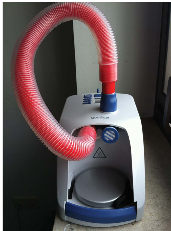
Figure 2: Fisher & Paykel disinfection tube placed in right position.