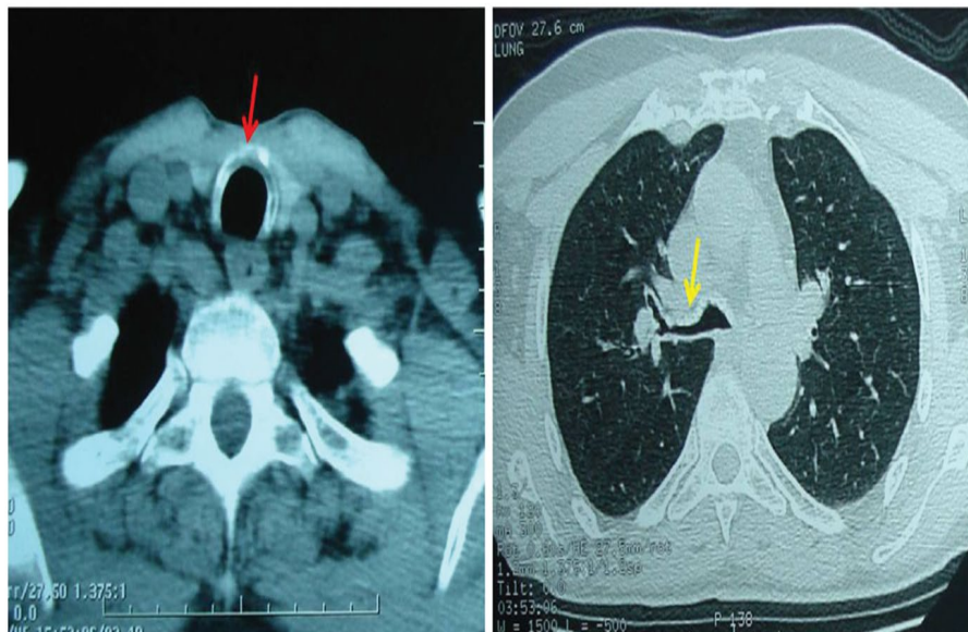
Figure 1: Stenosis of the trachea, swelling of cartilages and bilateral main bronchus.