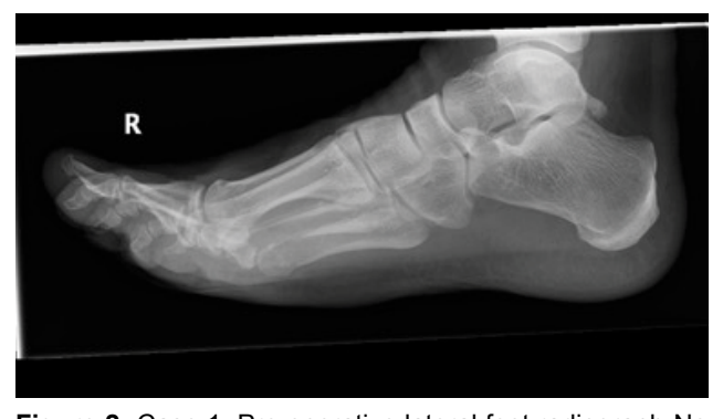
Figure 2: Case 1: Pre-operative lateral foot radiograph-No evidence of bony involvement.

no lymphovascular or perineural invasion. The lesion was staged as pT4b.