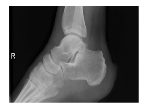
Figure 8: Case 2: Preoperative lateral radiograph of right calcaneus showing a 2.8 cm soft tissue lesion, which arises from the skin of the heel.