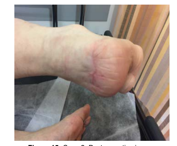
Figure 15: Case 2: Post-operative image.

Achilles tendon power, however, the alternative to achieve margins and get skin closure was a below knee amputation. Total surgery time for this procedure was less than thirty minutes.