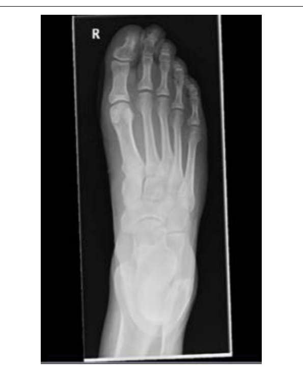
Figure 1: Case 1: Pre-operative anteroposterior foot radiograph-No evidence of bony involvement.

Radiographs of the right foot were obtained and there was no bony involvement (Figure 1 and Figure 2). He underwent right plantar biopsy. Histology revealed amelanotic malignant melanoma of the nodular subtype. The Breslow thickness was > 4 mm, ulceration was present, all margins were involved, however, there was