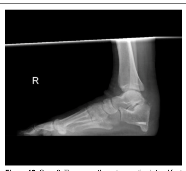
Figure 12: Case 2: Three-month post-operative lateral foot radiograph. The calcaneal tuberosity, origin of the plantar fascia, was retained, as was the subtalar joint; The Achilles tendon was reattached to the residual calcaneous.

ma of the right heel with a Breslow thickness of 9 mm. Ulceration was present, however there was no lymphovascular invasion or perineural invasion. Adjacent papules were present, and these were thought to be likely intransit metastases. PET scan and MRI brain did not reveal any distant disease.