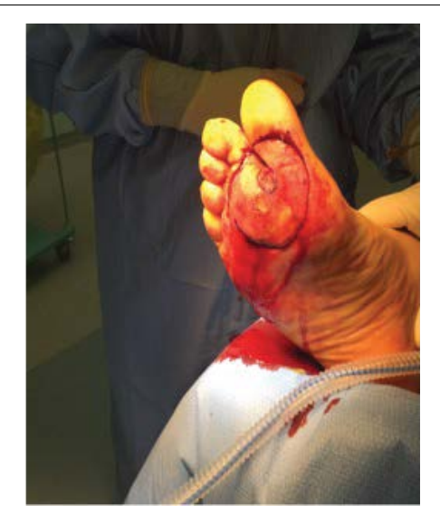
Figure 3: Case 1: Post skin incision to demarcate area - demonstrates size of the lesion and the size of the wide local excision needed in order to achieve clear margins.