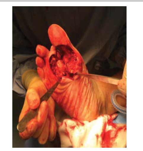
Figure 5: Case 1: The second toe was degloved and the distal one third of the metatarsal bone excised providing both full thickness sensate skin cover and a narrowed foot to allow partial primary closure.