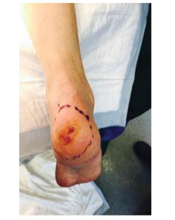
Figure 7: Case 2: Preoperative wide local excision.

He was prescribed an accommodative foot orthotic post-operatively and can fully weight bear.