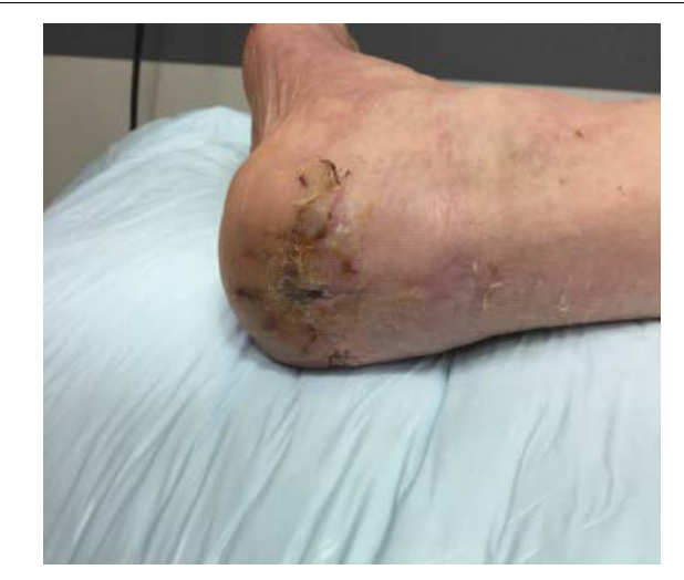
Figure 13: Case 2: Post-operative image.