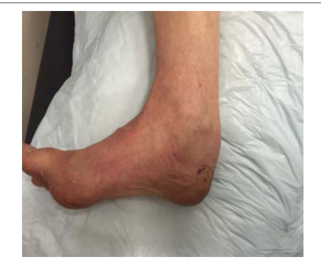
Figure 14: Case 2: Post-operative image.