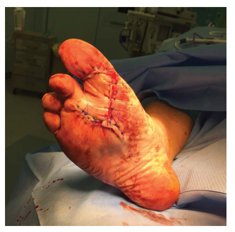
Figure 6: Case 1: Post closure.