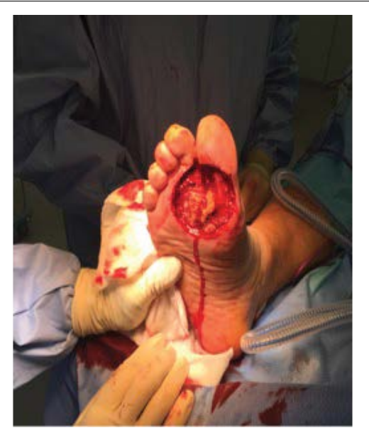
Figure 4: Case 1: Post excision of lesion - remaining defect.