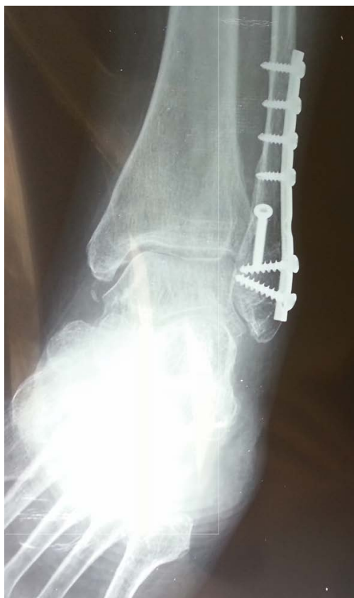
Figure 2: Post-operative AP radiograph of the ankle one month after surgery, with reduced fixation grip strength intraoperatively position 2 (S2). The reduced fixation grip is not visible.

For the fixation of the plate, screws in the first and second hole of the plates were used in all cases. The third hole screw was used only in 58 (42.6%) plates, because of lag screw placement in 20 (14.7%) of the fractures, syndesmotic screw placement in 7 (5.1%) cases and finally owing to extended comminution, in the rest of the fractures.