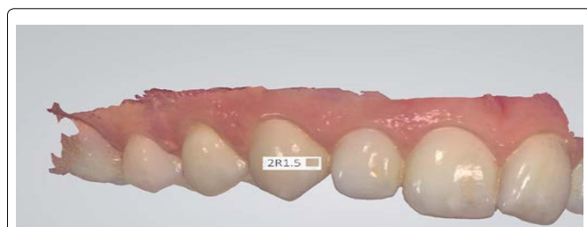
Figure 1: The TRIOS ® Color System, where teeth are scanned and a computer automatically measures the shape of the selected tooth using a well-known shade guide

The traditional, visual, subjective method using the Vita 3D-MASTER ® system (Vident, Brea, CA, USA) was used as control for the shade evaluation and for the validation procedure. The Vita