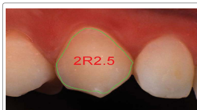
Figure 2: A photograph using the MHT Spectroshade ™ device for colorimetry

The conventional, human shade assessment comparing visually the central region of the shade tab with the central region of the natural tooth and selecting the shade tabs that matches the best was done. Two dentists performed the measurements blindly e.g. all shade numbers were hidden and the dentist performed the measurement independent of one another. Secondly the 3Shape Trios ® scanner with the Trios ® Color measurement tools and the MHT SpectroShade ™ were calibrated and assessed the color at the same teeth. Two dentists